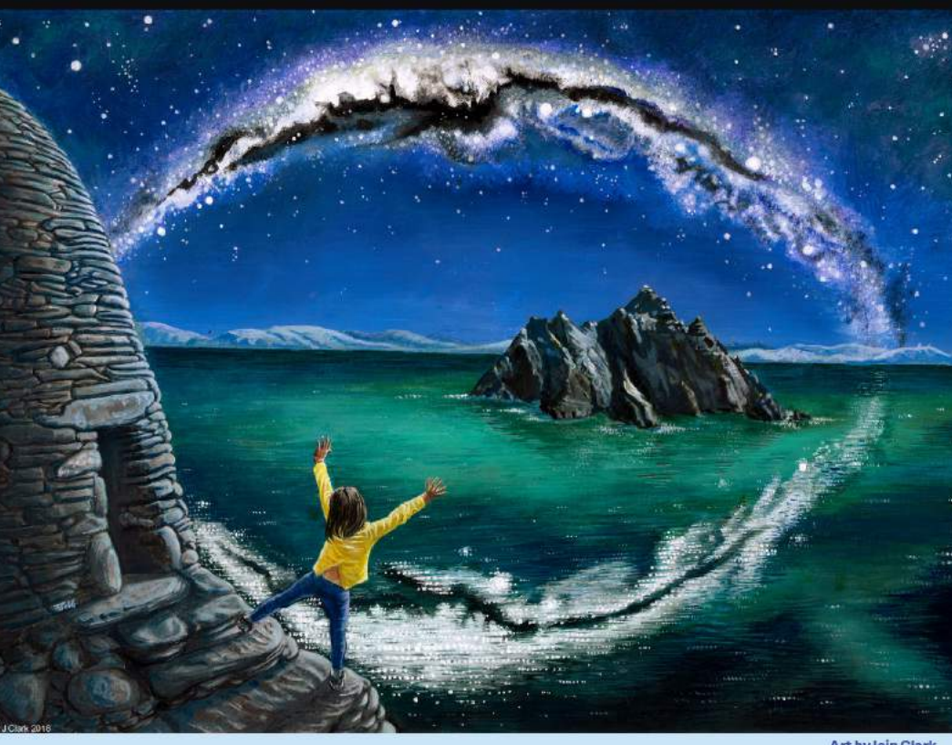
Art by Jain Clark

August 15 - 19, 2019 Convention Centre Dublin www.dublin2019.com facebook: dublin2019 twitter: dublin2019 info@dublin2019.com