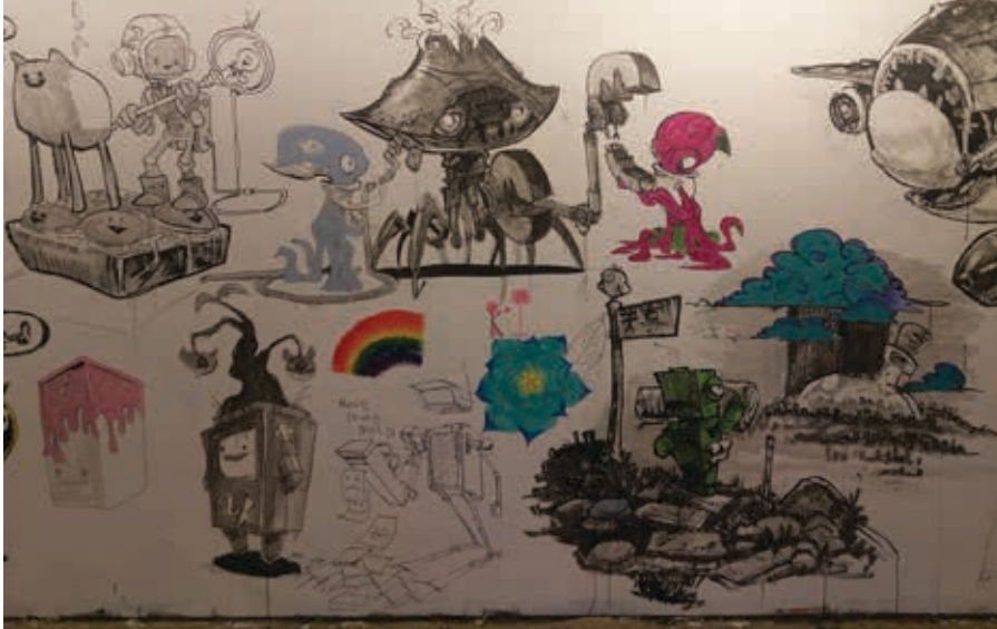
Mural in the Teen Lounge