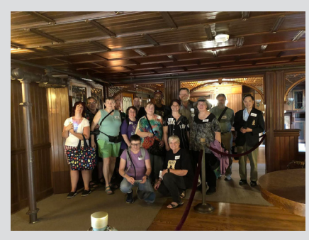
A group of early arriving fans enjoy the Winchester Mystery House Tour

"World Science Fiction Society," "WSFS," "World Science Fiction Convention,""Worldcon," "NASFIC," "Hugo Award," and the distinctive design of the Hugo AwardRocket are service marks of the World Science Fiction Society, an unincorporatedliterary society. Worldcon 76 is a committee of San Francisco Science FictionConventions, Inc., a California Public Benefit non-profit corporation recognized as aa tax-exempt 501(c)(3) charitable organization by the Internal Revenue Service.