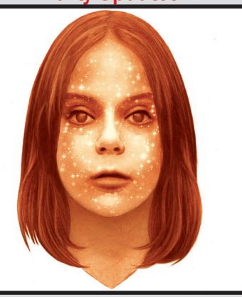
<u>Darwin's Children Kickoff Party</u> 8/16, 8:00 PM, Fairmont Hotel Hobbit Party

Bring the Feet! Bring the Adventure! There will be Second Breakfast. The Kiwi's Beak will be open and serving your favourite New Zealand Style Hobbit dessert fare. There will be spot the quote. There will be photo ops .... Room 576 at the Fairmont