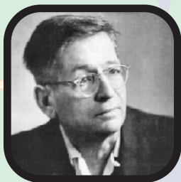
Edgar Pangborn (Ghost of Honor)

More than 25 years after his death, Pangborn's sister left his papers and literary works, including many not previously published, to Beagle who worked to bring the best of them into print.