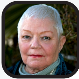
Chelsea Quinn Yarbro

Two life-changing things happened to Chelsea Quinn Yarbro in 1968: she attended her first WorldCon and she sold her first story. Since then, she has attended many more conventions and published 81 works of short fiction in multiple genres and is presently working on her 95th sold book.