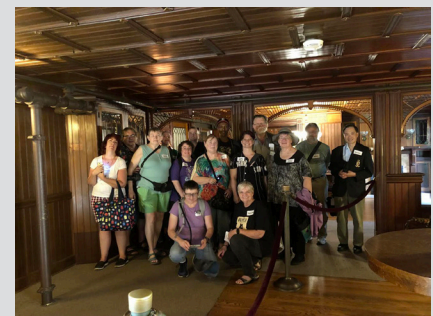
A group of early arriving fans enjoy the Winchester Mystery House Tour

“World Science Fiction Society,” “WSFS,” “World Science Fiction Convention,” “Worldcon,” “NASFiC,” “Hugo Award,” and the distinctive design of the Hugo Award Rocket are service marks of the World Science Fiction Society, an unincorporated literary society. Worldcon 76 is a committee of San Francisco Science Fiction Conventions, Inc., a California Public Benefit non-profit corporation recognized as a tax-exempt 501(c)(3) charitable organization by the Internal Revenue Service.